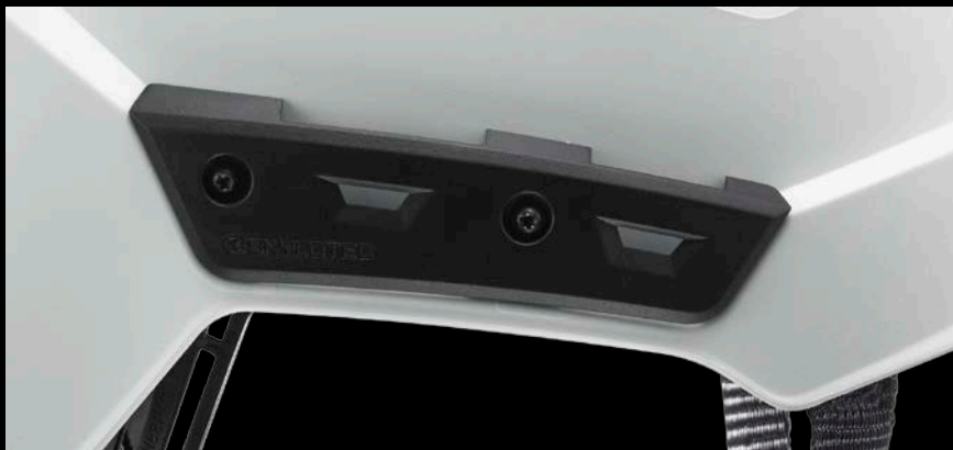
Gear Rack X-changeable